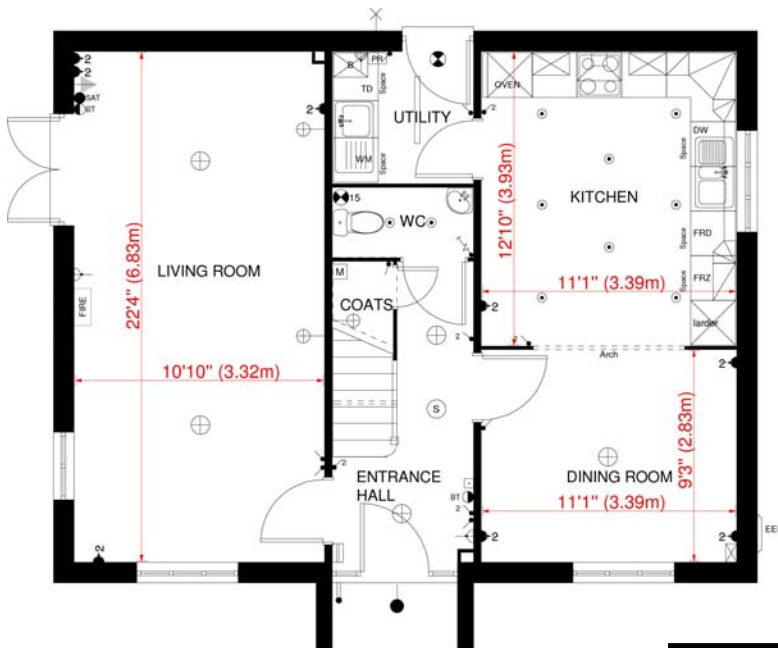
GROUND FLOOR PLAN 'ADDINGTON D' HOUSE TYPE - HEMSBY